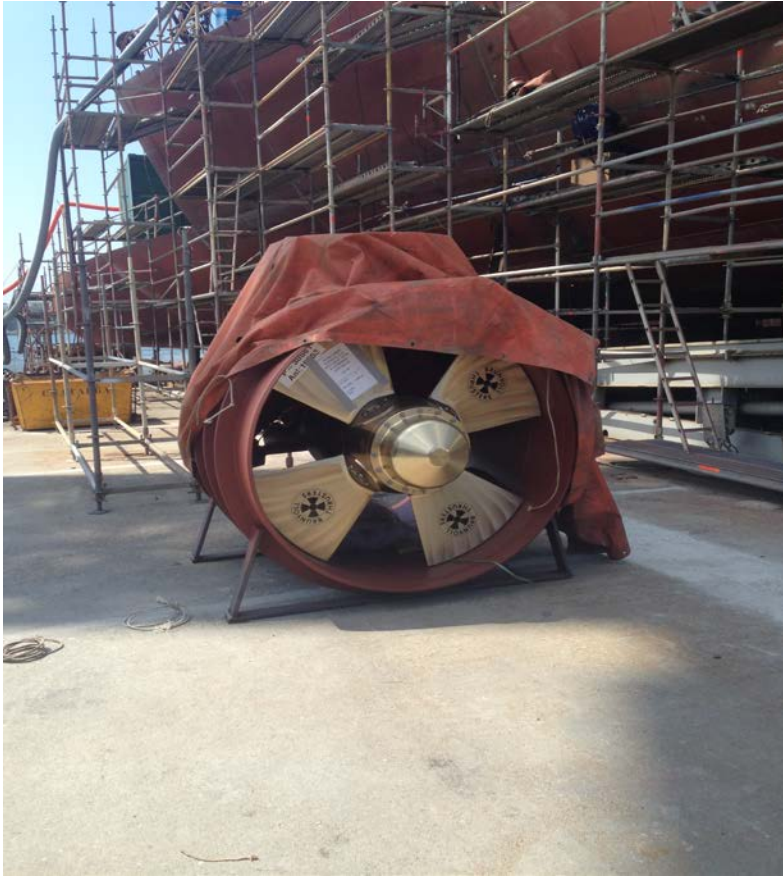
Azimuth thruster installed