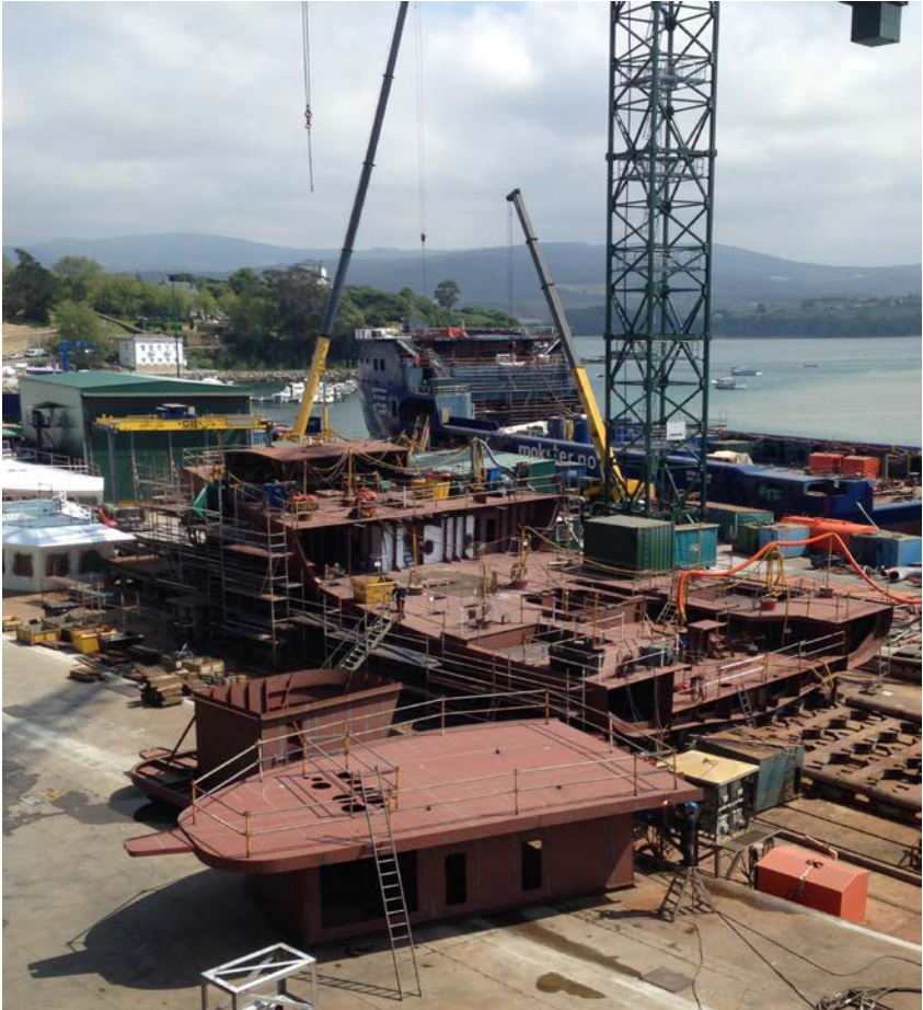
6 Blocks assembled on slipway