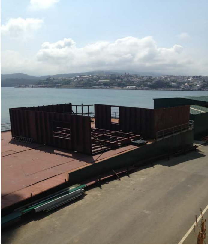
BL 16 - Bow section - progressing